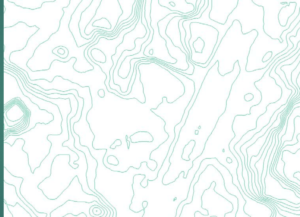
Filtered DEM (Low)

The image above shows 1 ft contours derived from the same DEM smoothed using the Filter tool with a "Low Pass" filtering option in Spatial Analyst before the contours were created.